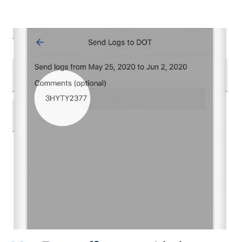
03 - Enter officer-provided Data File.