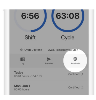
02- Tap the Roadside icon.