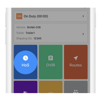
01– Open the Samsara Driver App and tap the HoS icon.