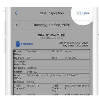
01– From the Roadside Inspection screen, tap 'Transfer'.