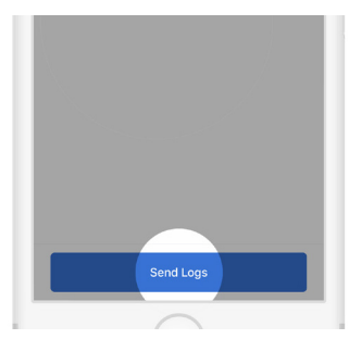
04- Tap 'Send' to send logs to DOT.