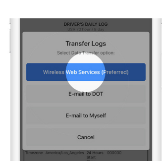
02- Send official logs via Wireless Web Services or E-mail to DOT.